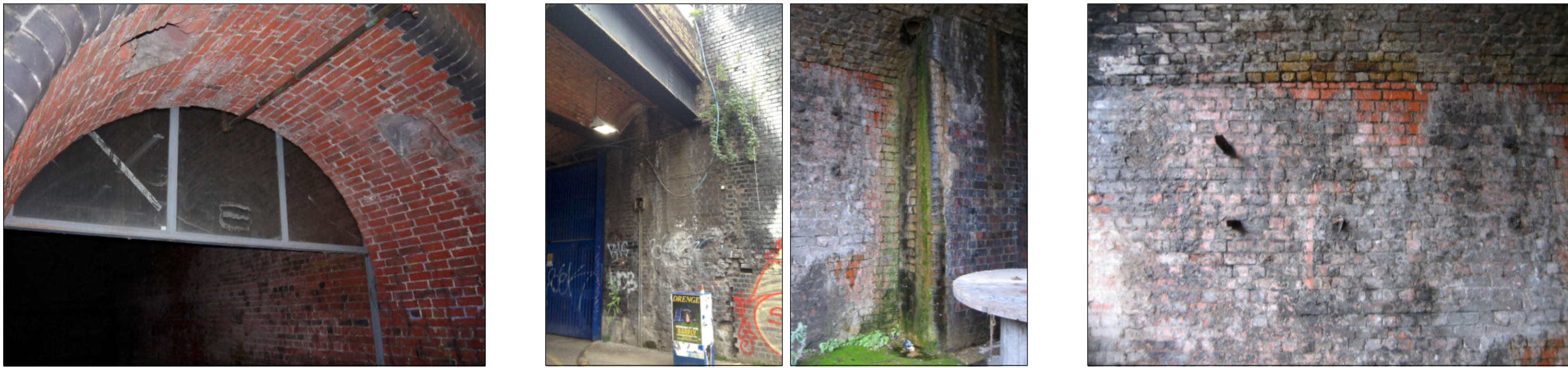
EXAMPLES OF BRICKWORK REQUIRING REMEDIAL MEASURES - Please refer to Structural Engineers report for description of required works.